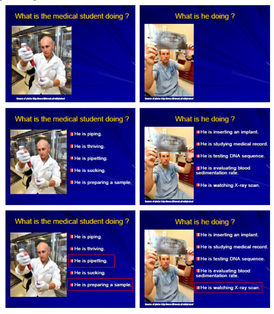
Fig. 1 Typical multiple- (left) and single-choice tests (right) combined with photographs of typical professional activities. The sequence of PowerPoint slides starts from top to the bottom. After finding proper expression(s), the other expressions are translated and their use discussed.

effective way of teaching professional English, especially if more questions (and answers as well) might be related to a single picture covering several closely related aspects of a topic (e.g. components of cross sections of tissues and organs). Right answers are highlighted interactively after each step. Wrong answers are discussed immediately. The level of interaction is high in these tests, however well ballanced by a teacher according to the quality of students group. It was reported just recently that too much interaction did not bring any significant gain (Torff et Tirotta 2010).