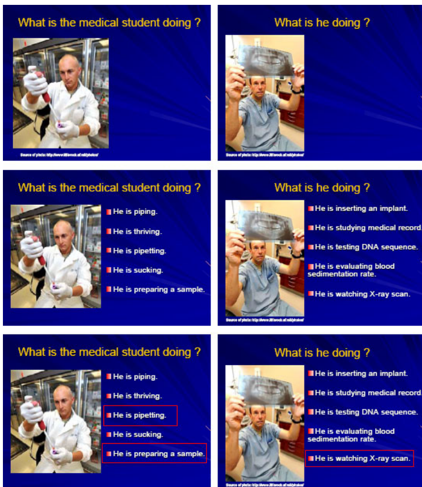
Fig. 1 Typical multiple- (left) and single-choice tests (right) combined with photographs of typical professional activities. The sequence of PowerPoint slides starts from top to the bottom. After finding proper expression(s), the other expressions are translated and their use discussed.

effective way of teaching professional English, especially if more questions (and answers as well) might be related to a single picture covering several closely related aspects of a topic (e.g. components of cross sections of tissues and organs). Right answers are highlighted interactively after each step. Wrong answers are discussed immediately. The level of interaction is high in these tests, however well balanced by a teacher according to the quality of students group. It was reported just recently that too much interaction did not bring any significant gain (Torff et Tirota 2010).