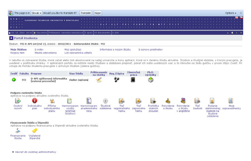
Picture 3: Screenshot showing the work with academic information system on FEI