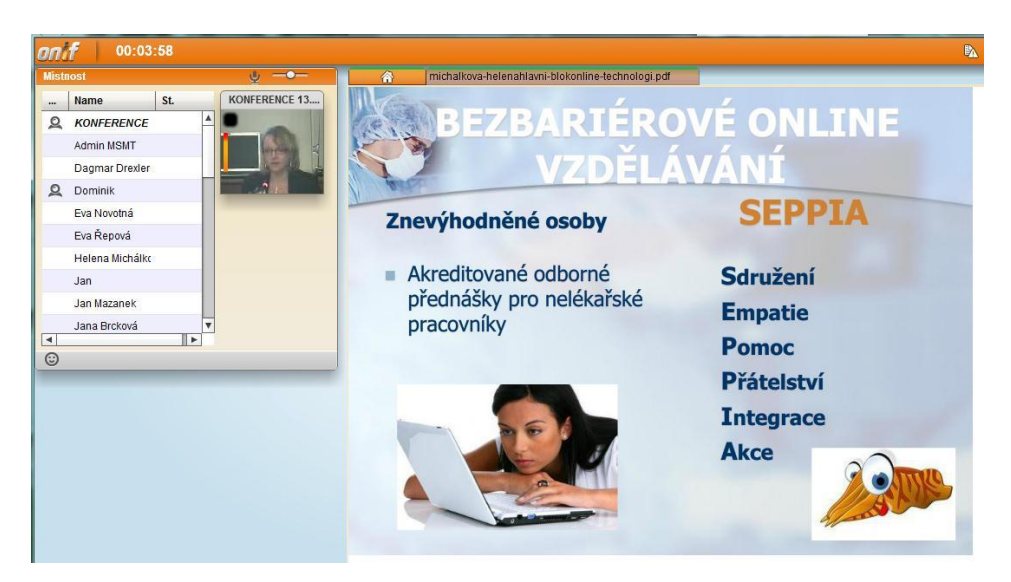
Figure 3. Virtual Lecture Room Onif